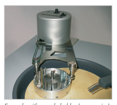
Example with sample holder (accessories)