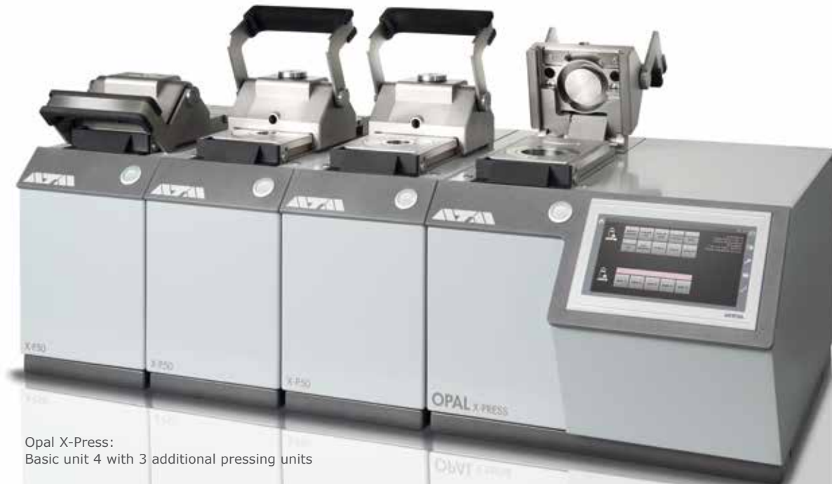
Opal X-Press: Basic unit 4 with 3 additional pressing units

The hot mounting press Opal X-Press was developed for fast, simultaneous mounting of several materialographic specimens which may differ in size and material. The modular design allows for individual configuration of each mounting process.