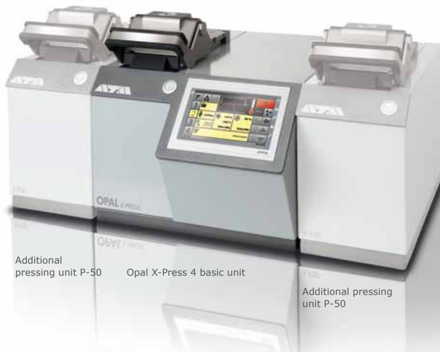
Additional pressing unit P-50

With the Opal X-Press 4 any kind of sample quantity can be handled comfortably. Up to 4 mounts can be done simultaneously and independently from each other which is ideal for handling large quantities of mounts. The basic unit includes one pressing unit and is extendable by 1, 2 or 3 additional mounting units any time. The diameter of the mount of each pressing unit is chosen individually by 25.2 mm, 30 mm, 1 ¼" (~32 mm), 1 ½" (~38 mm), 40 mm, 50 mm - each diameter with or without chamfer. The additional units can be placed on both sides of the basic unit.