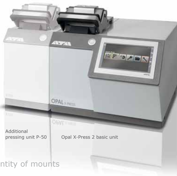
Additional pressing unit P-50

The Opal X-Press 2 is the perfect choice for small and medium quantities of mounts. The basic unit already includes one pressing unit and can be extended with 1 additional mounting unit at any time. The additional unit is operated independently and simultaneously. It may be placed on the left or on the right side of the basic unit.