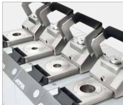
Modularity in diameter size and units