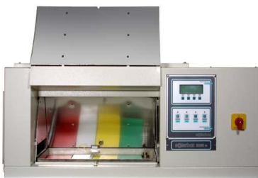
Solarbox 3000e: table top xenon testers 4 models