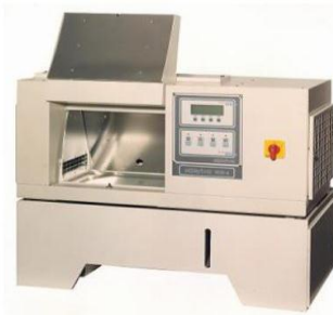
Solarbox 1500e with flooding