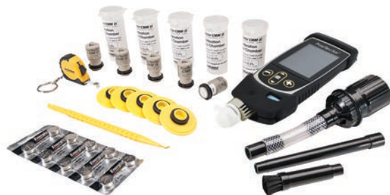
PosiTector CMM IS Pro Kit includes the PosiTector DPM Advanced

Replacement chambers, salt solutions, tools, caps, stackable probe extensions, and fins are available upon request