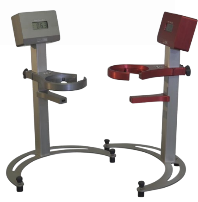
Figure 1. Flow Timer in different colours