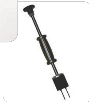
BLD5055 Heavy Duty Hammer Probe