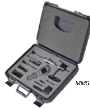
MMS2 Hard Carry Case Kit

Accuracy at 77°F (25°C) +/- 1.3°F (0.7°C)