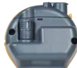
Quikstick ST POL78751, standard with all MMS2 kits and with the same performance as the standard Quikstick. A Quikstick ST can remain connected to the MMS 2 while using the pins.

Readings from multiple Hygrosticks can be taken and recorded with ease. Humidity readings can be taken with the use of humidity sleeves or humidity box. Hygrosticks, not Humisticks, should be used for this test.