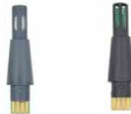
Hygrostick part number POL4750, for high moisture applications.