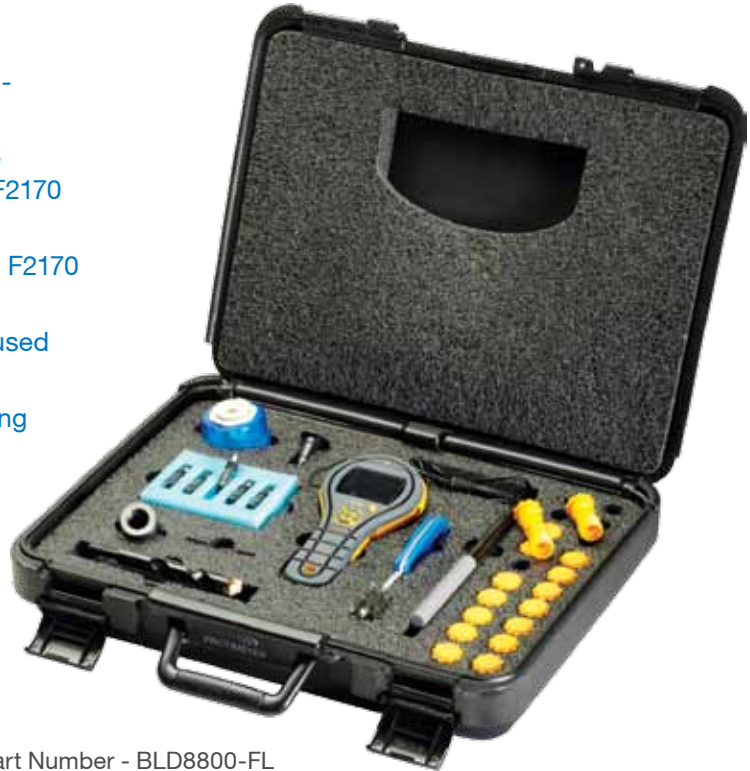
Part Number - BLD8800-FL