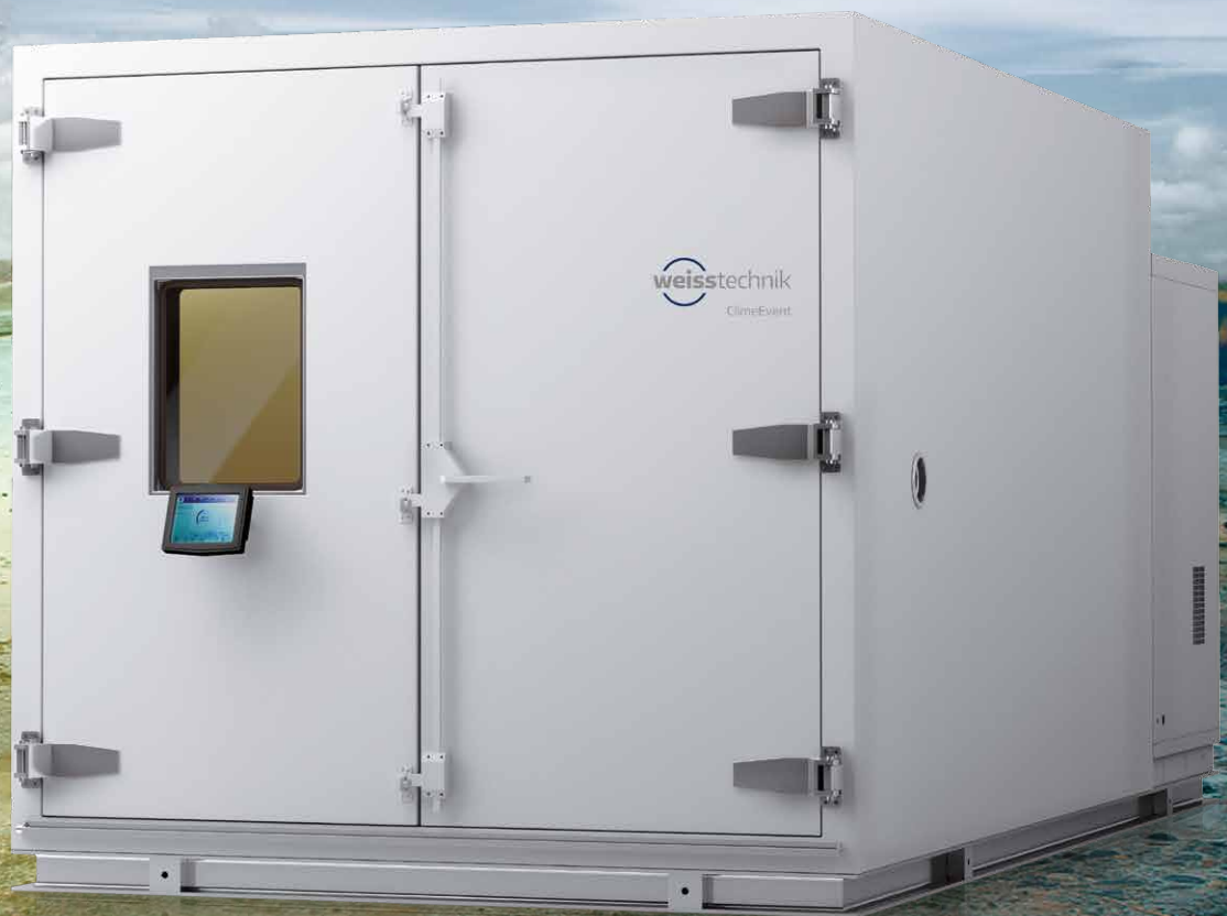
Illustration is similar, contains optional equipment