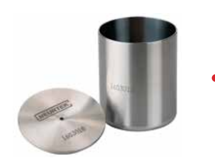
To determine the specific gravity of paints, inks, pastes, adhesives, etc. Produced in high grade of stainless steel .