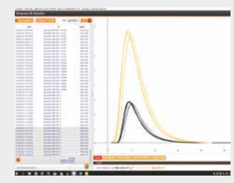
Analysis results after 40 - 60 sec