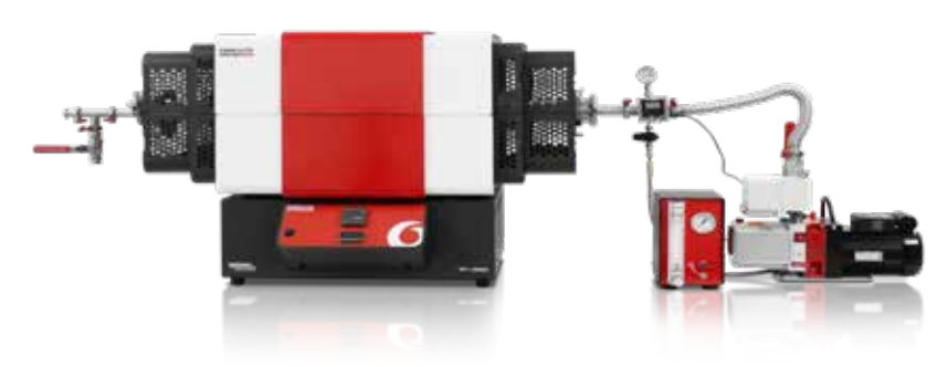
TF tube furnace combined with the Rotary vane pump package and vacuum work tub package

Combining a vacuum pump package with a work tube vacuum package offers a complete solution for horizontal tube furnaces. Please contact Carbolite Gero for assistance