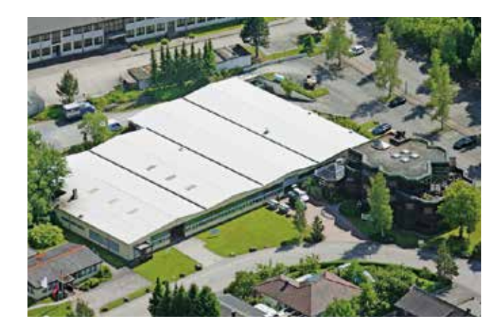
Carbolite Gero, Neuhausen/Germany

All products, and more, featured in this catalogue are available through your local Carbolite Gero office, Verder Scientific office or an extensive network of 3rd party dealers and sales organisations.