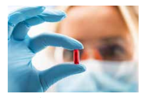
I Medicine / Pharmaceuticals