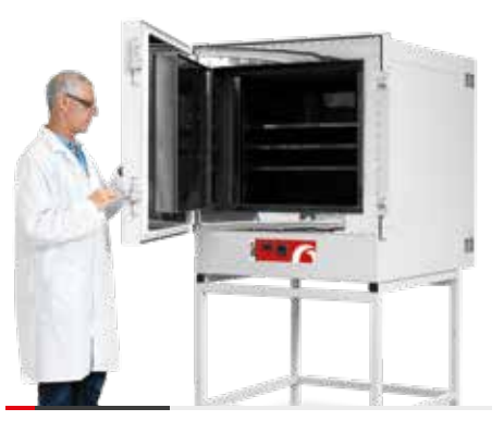
INDUSTRIAL OVEN HT