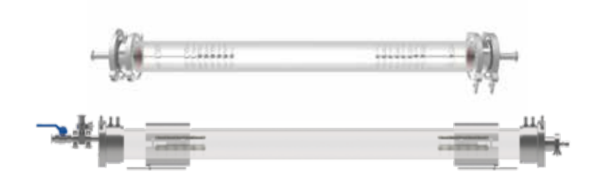
Examples of work tube packages