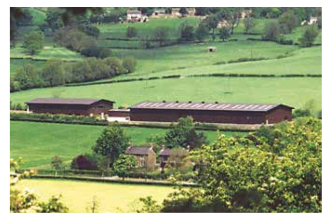
Carbolite Gero, Hope/United Kingdom