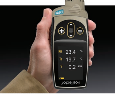
PosiTector DPM A shown with Auto rotating display with Flip Lock.