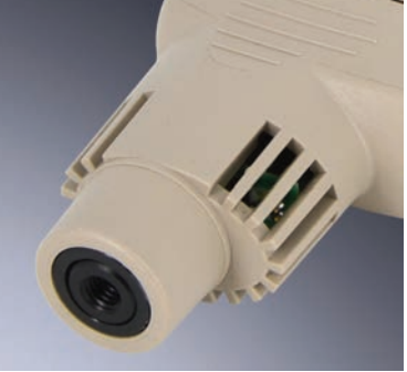
PosiTector DPM D includes ½" NPT threads PosiTector DPM IR probe includes a noncontact infrared surface temperature sensor.